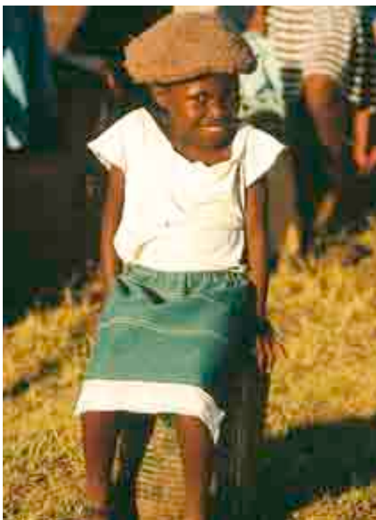
Umnqwazi wewulu omdaka ngebala.