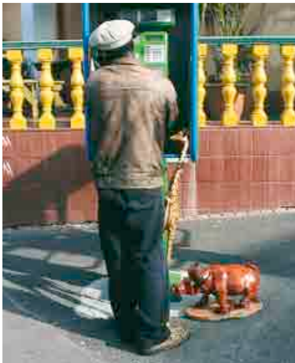
Inyathi embala umdaka ebengezelayo.