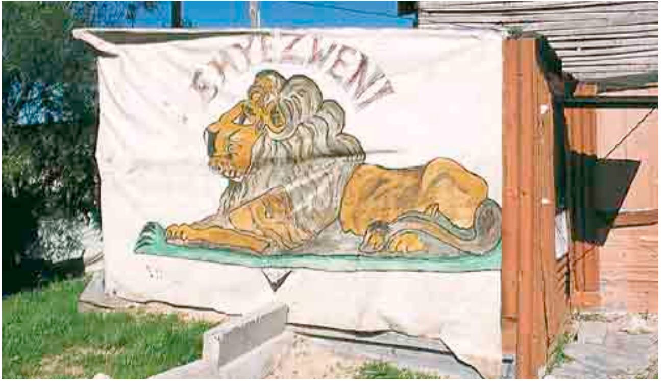
Ingonyama emdaka efakwe umbala.