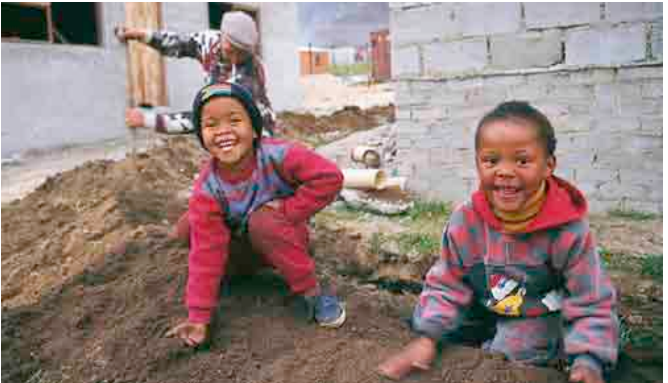
Udaka olumdaka ngebala olungcolileyo.