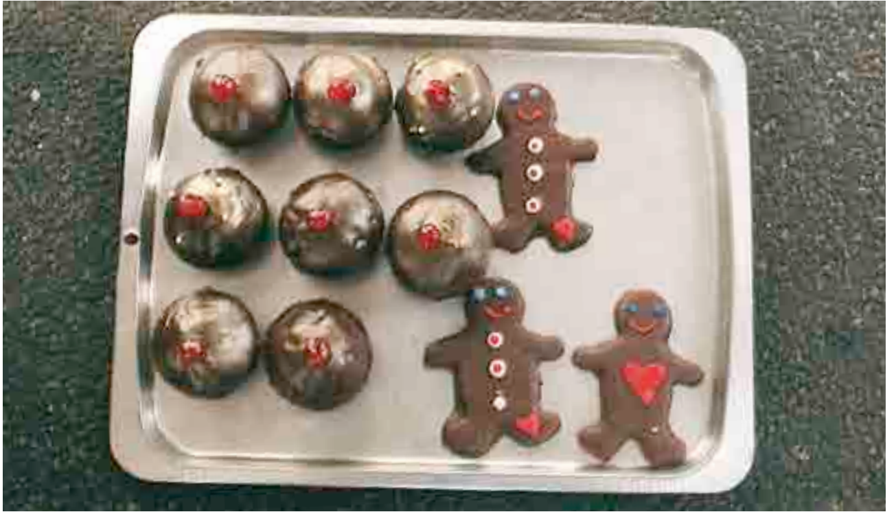
Ikeyiki ezimdaka ngebala ezimnandi.