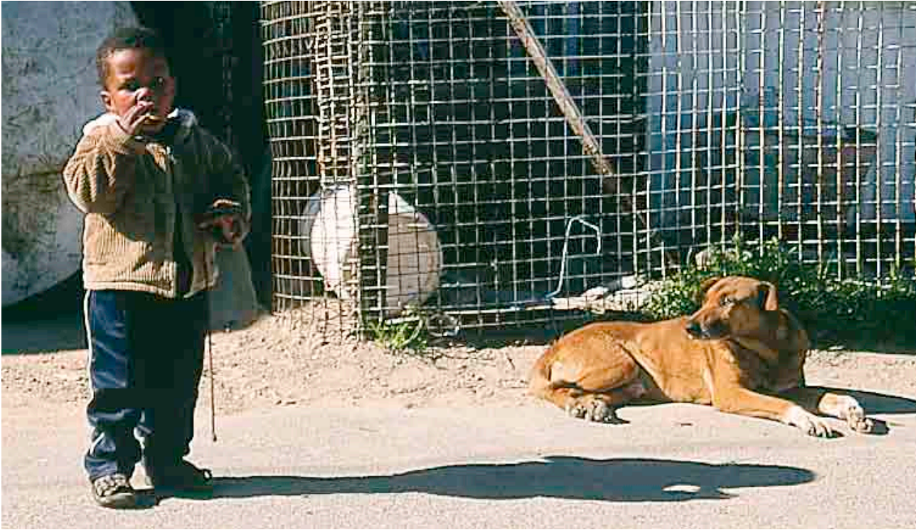
Inja emdaka ngebala egudileyo.