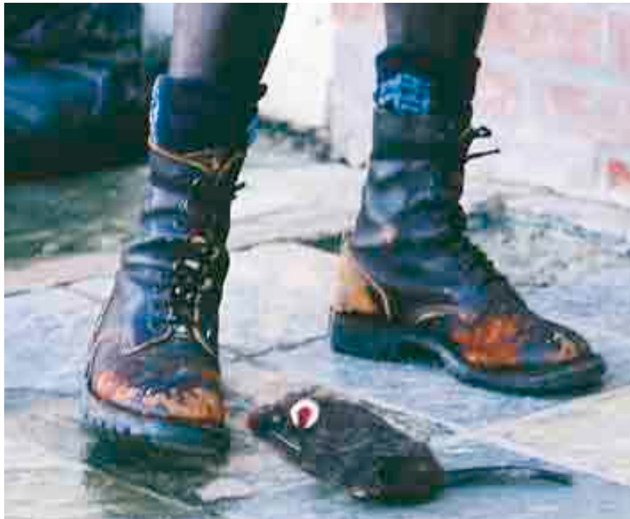
Ibhutsi ezindala ezimbala umdaka.