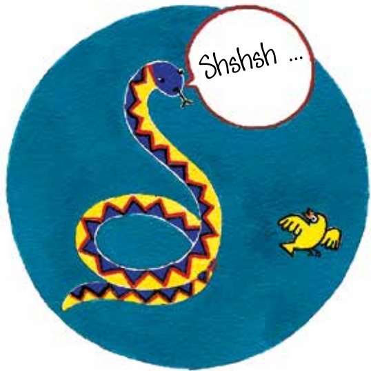
Dinoha di ya hweshetsa.