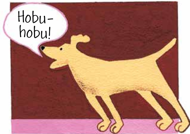
Dintja di a bohola.