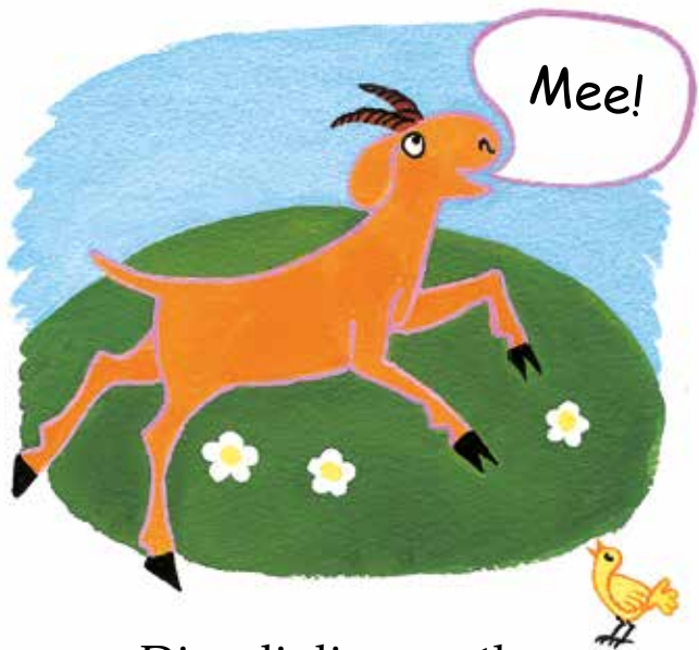
Dipudi di a gwetla.