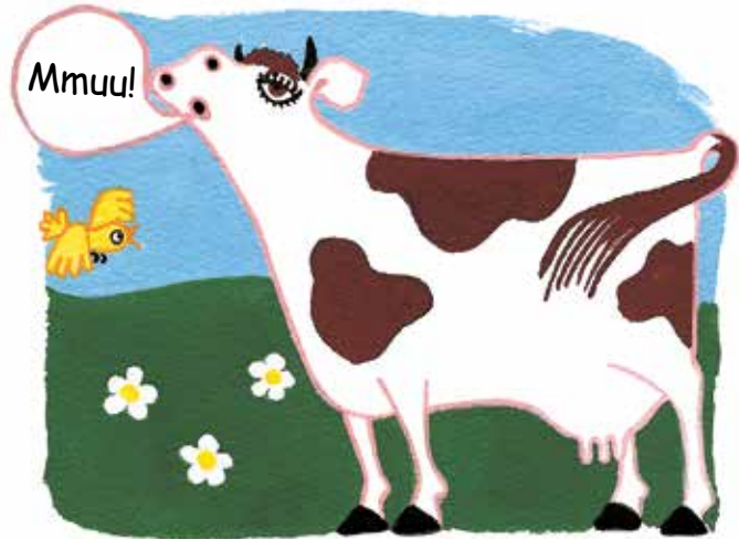
Dikgomo di a lla.